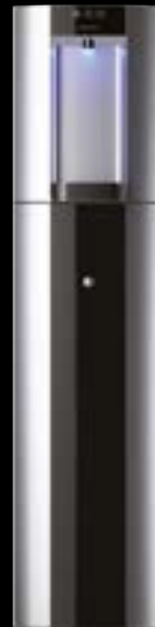
Silver - Floorstanding