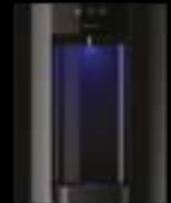
Black - Countertop