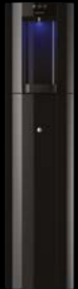
Black - Floorstanding