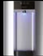
Silver - Countertop

Contains 3M carbon filter and parts required for easy installation.