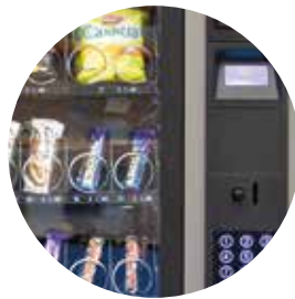
An elegant and uncluttered design